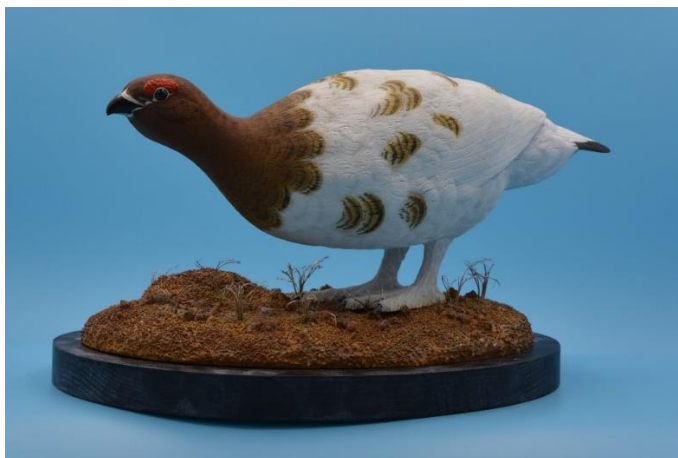
Bob Lavender $1000.00 Purchase Award- Willow Ptarmigan