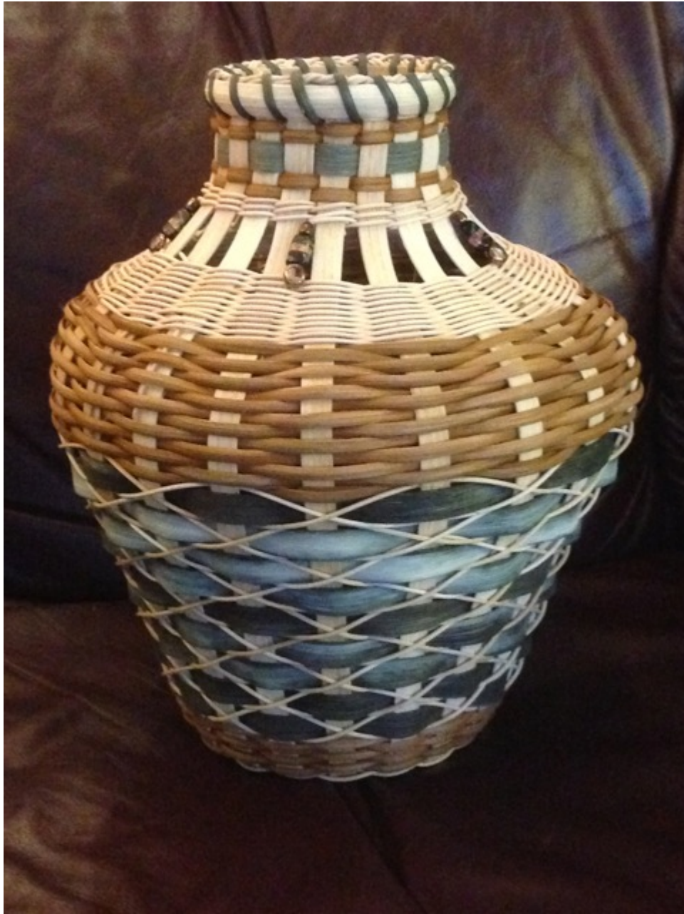
Second Basket: Genie Basket: July 13 th full day and July 14 th AM.

This basket starts with a T-pin start and twines to a 6" base, then gradually swells to about 10" across before it shrinks to its' 4" neck at 12" tall. This basket's main goal is to teach shaping, and the beautiful Japanese wave weave, seen in the "X" pattern over the wider flat reed.